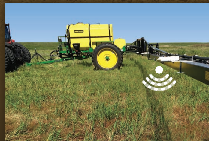
RiteHeight on a Bestway Fieldpro sprayer with 90ft boom.