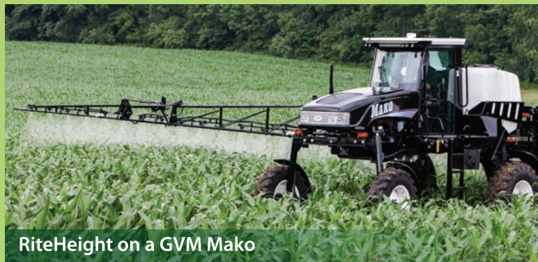
RiteHeight on a GVM Mako