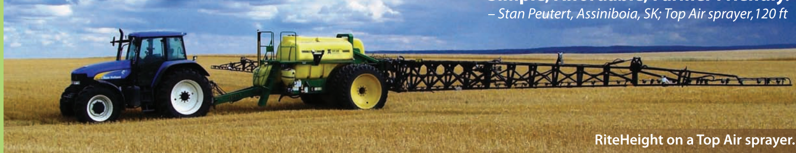
RiteHeight on a Top Air sprayer.

"Simple, Affordable, Farmer Friendly." – Stan Peutert, Assiniboia, SK; Top Air sprayer, 120 ft