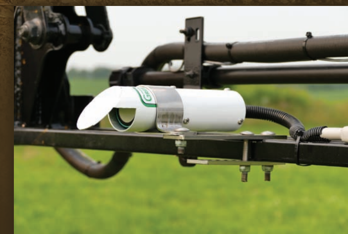
Compact sensor brackets allow for a variety of mounting options.