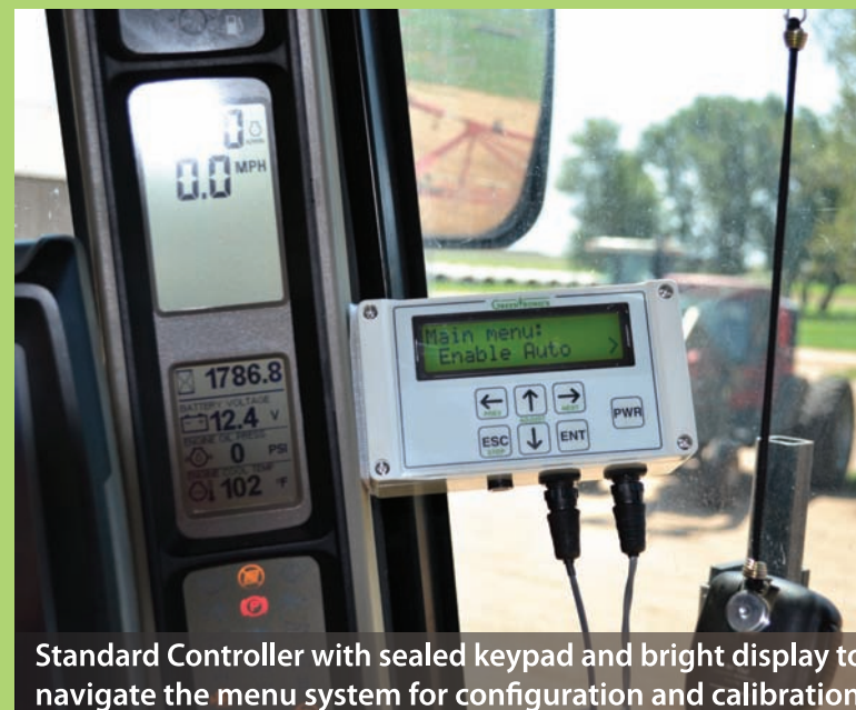
Standard Controller with sealed keypad and bright display to navigate the menu system for configuration and calibration.

"I installed the 2-sensor RiteHeight system six seasons ago. No service or repairs needed since. Still works like new. I'm really pleased with it. Great value package!" – John Vanderlinde, Glencoe, ON; Rogator 664 with 120ft booms