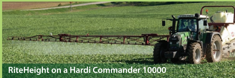
RiteHeight on a Hardi Commander 10000