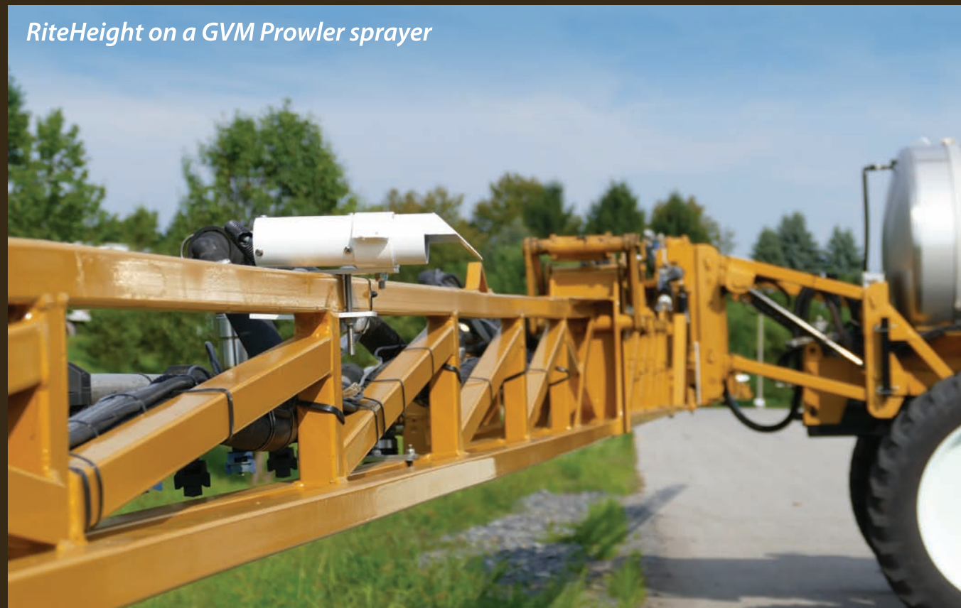
RiteHeight on a GVM Prowler sprayer