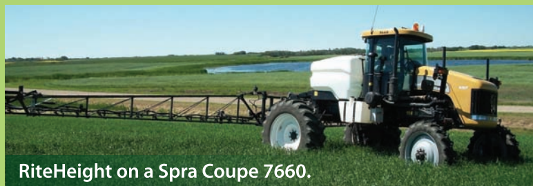
RiteHeight on a Spra Coupe 7660.